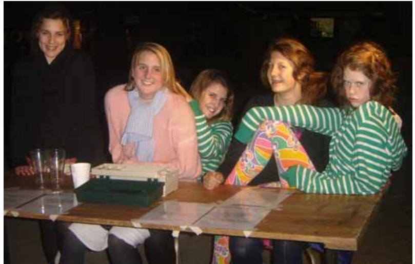
The Stage 2 Crew on the gate for the Hop. After a week at Woll they still couldn't get enough, and went straight to the Hop and kept working.

We raised over $500 on the night at the stawell, which also included the auction of Wilbo's chairs. Thanks heaps to Will for those impressive donations. There is also more money on it's way from Tom Hay, the organiser of the Hop.