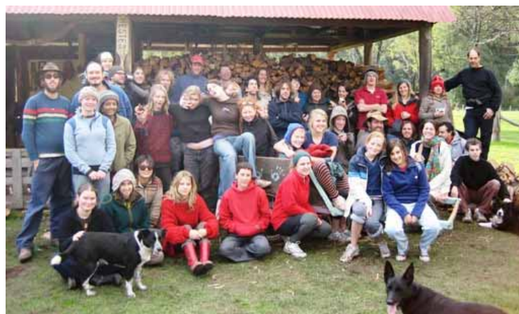
The obligatory group shot of the 2006 wood chop—thanks to everyone!

socky, moving the garden toilet (the hole was completed in the days after woodchop—thanks Sam!), bringing in a new toilet that we've acquired, maybe some revegetation work. Additionally, we'll do a bit of a road trip in The White Rocket to say g'day to Mittagundi and The Crossing. And I'm sure that there will be things that go wrong between now and then that will occupy as also.