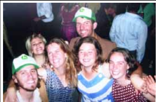
The Woll crew (plus Hayley) living it up as they get down.