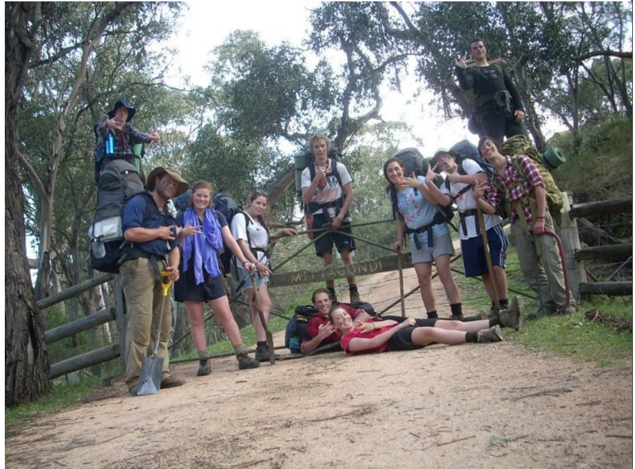
The Wolla-gundi crew