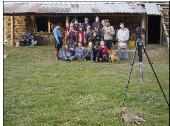
Burgoynes before we started work...and the crew in front of the brand new verandah